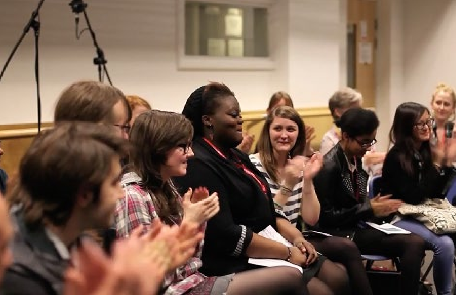
Ear Opener workshop at City and Islington College